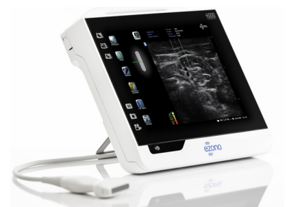
The portable eZono®4000

Weighing in at 4.7 kg, the eZono®4000 meets the wish for a small, portable device. It is reminiscent of a tablet PC.