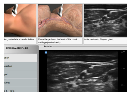
Various display modes help the clinician

Adaptive needle tracking and a selection of display modes facilitate assessment. The position of the needle tip can be correctly identified both with the in-plane and out-of-plane method.