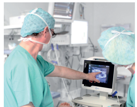
Ultrasound-guided navigation with eZono in action

Ultrasound has been used in diagnostic tests for a long time. There is hardly any baby whose size or position has not been determined by ultrasound. In general, this technology is perceived as safe. The exposure to contrast agents or radiation that occurs with other imaging techniques is eliminated. During an ultrasound check, a transducer moves back and forth or rotates over the skin. It sends ultrasonic waves into the body and receives the reflected signals. These vary